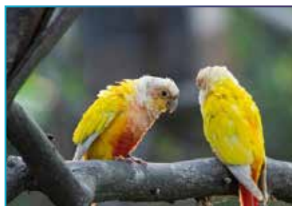
CHANDIGARH BIRD PARK