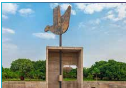
OPEN HAND MONUMENT

Some of the best places to visit in Chandigarh while planning a trip to the north side of the country include Zakir Hussain Rose Garden, Sukhna Lake, Rock Garden, Chandigarh Bird Park, Terraced Garden, ISKCON Temple, Pinjore Garden, Leisure Valley, Sector 17 Market, Government Museum & Art Gallery, Le Corbusier Center, International Doll Museum, Butterfly Park, Fun City and Open Hand Monument. More: https://chandigarhtourism.gov.in/